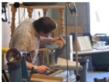
Working on the rim