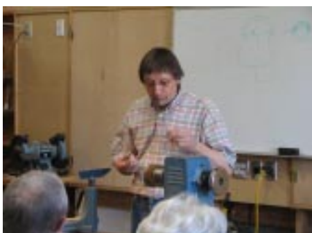
Showing the Saturn box