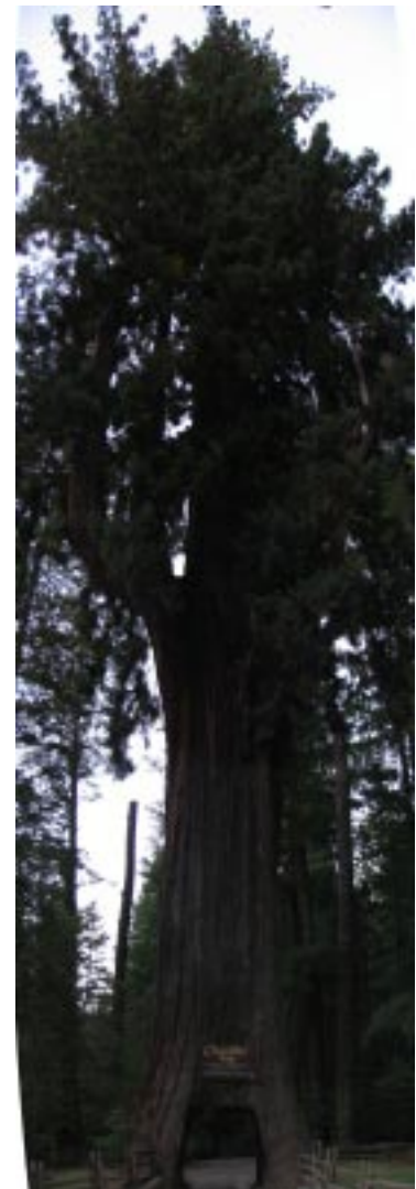
Chandelier's Drive Thru Tree