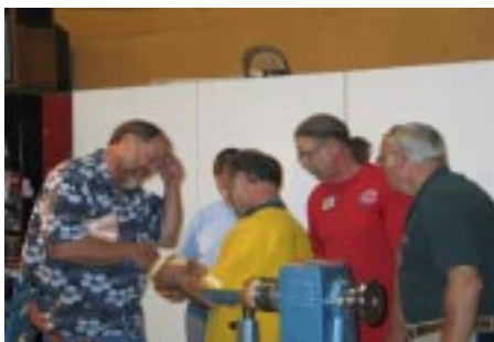
Good advice or a Caltrans work crew?