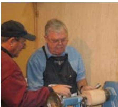
Never enough good advice

Probably the biggest benefit to all participants was the knowledge shared among turners.