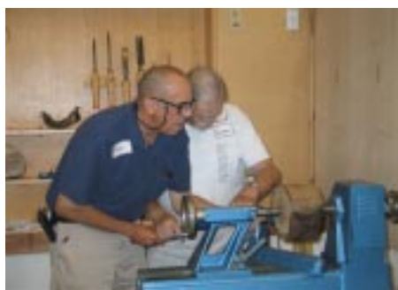
Winding the tailstock is a two hand operation