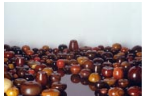
100 Spirit Vessels

David has written numerous articles about woodturning and has been a significant contributor, not only to woodturning publications, but to other groups as well, such as the Collectors of Wood Art.