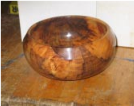
A very nice spalted bowl