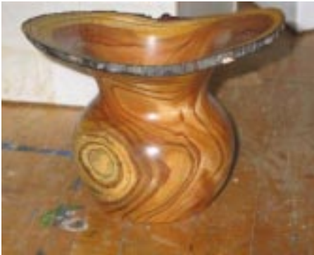
A natural edge vase