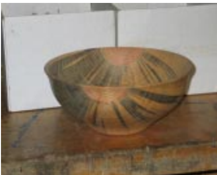
Star pine bowl - side grain orientation