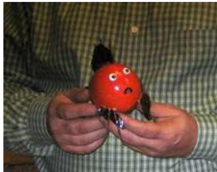
Joe Fleming's fish