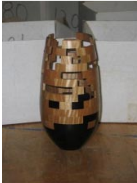
Dan Leaf's open segmented vessel