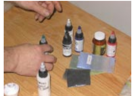
Michael showing painting options