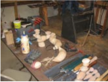
An assortment of class projects