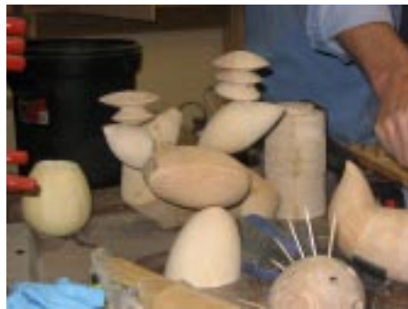
Class project - candle holder