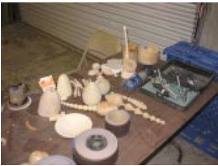
....and more projects