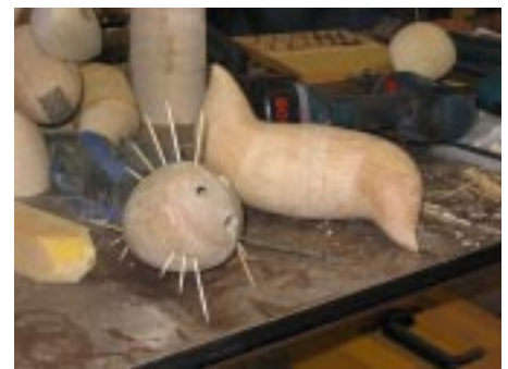
Class projects - fish and worm