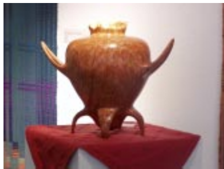
Oskar Kirsten's vessel