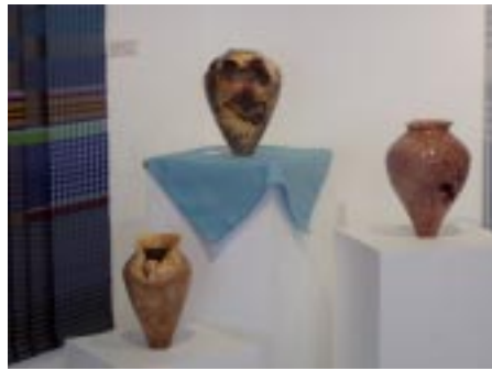
A trio of vases