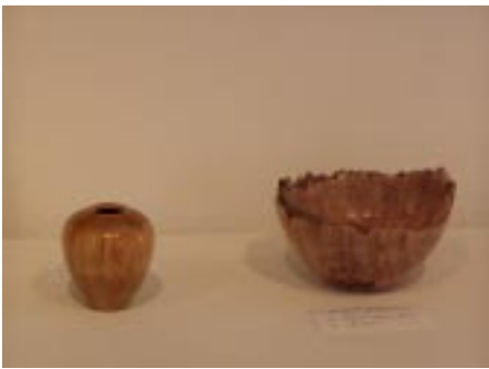
Two small pieces