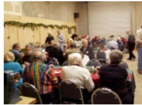
Christmas party revelers all having a great time eating, visiting, eating, and exchanging gifts. Did I say eating?