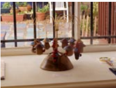
A display of birdhouse ornaments