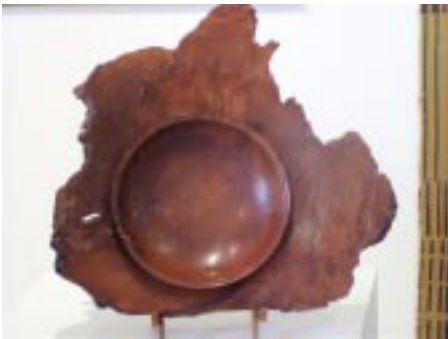
Natural edge bowl