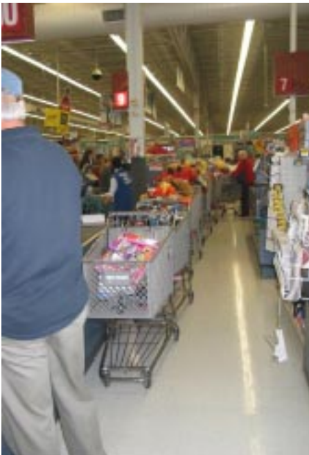
Lots of toys