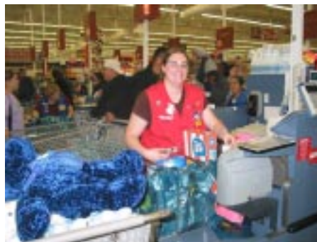
A friendly checker