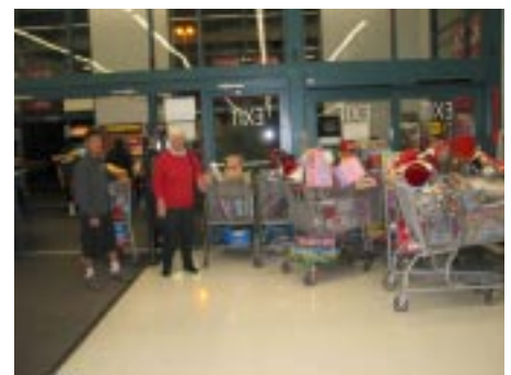
Setting off the alarms!