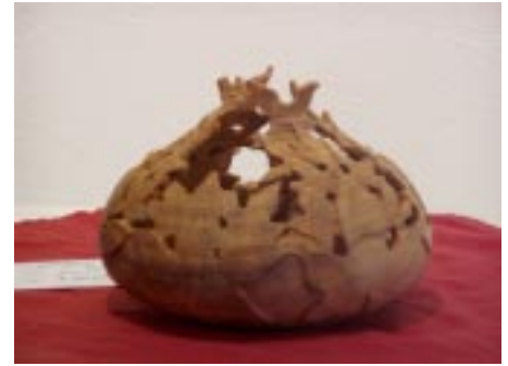
Jim Reeve carved vessel