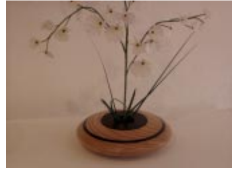
A bud vase