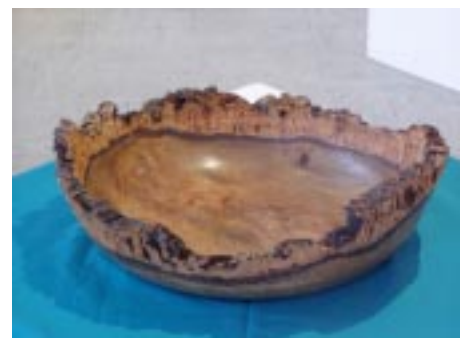
Tom Cumming's natural edge bowl