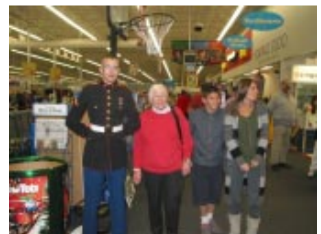
Part of the Oceanside gang