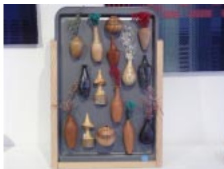
Turned magnet display