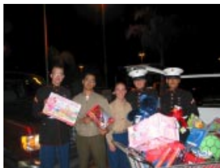
A whole platoon helps in Oceanside