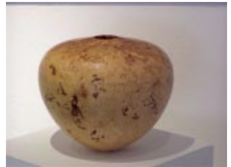
Horst Remmling's vessel