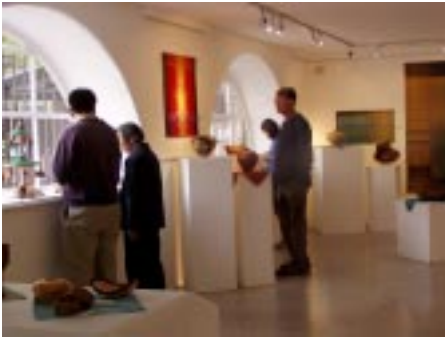
Gallery 21 with visitors