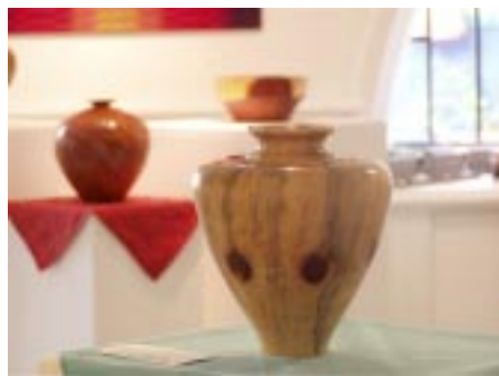
Several pieces on display