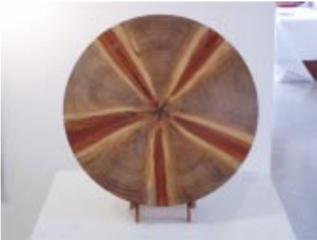
Russell Duff plate