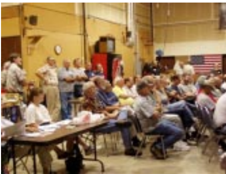
The audience is attentive