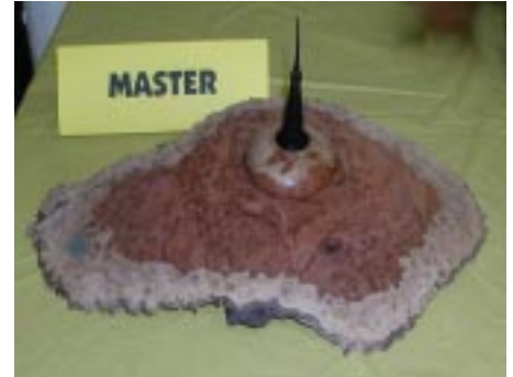
Pete Campbell - Master