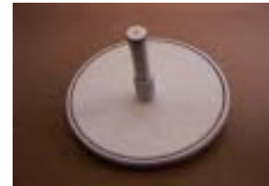
Three Finger Spinners