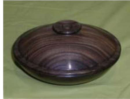
Paul Pankratz - Intermediate