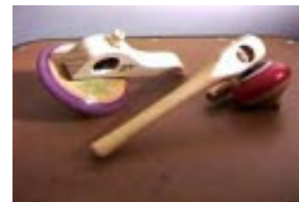
Wind and Pull