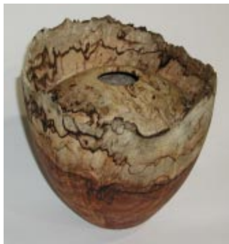
Jim Berger - Intermediate