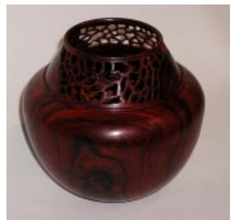
Pete Campbell - Master