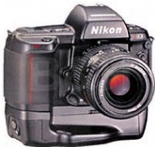
Shown with optional Lens and Grip

Next, he gave a detailed explanation of the various equipment and accessories needed to successfully photograph your work. He discussed cameras, film, lighting and other accessories.